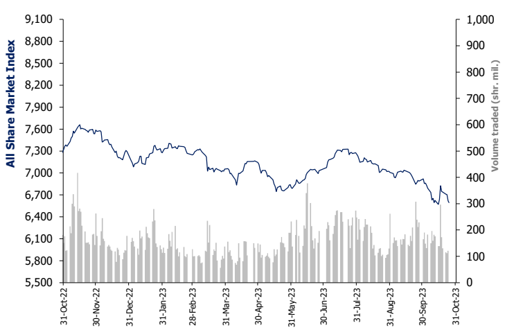
Index Performance relative to Volume